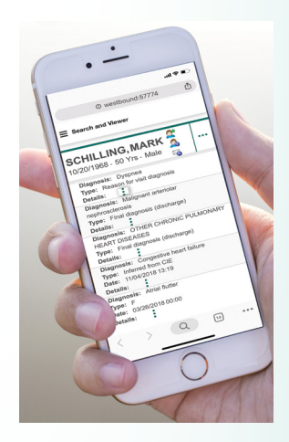
CLINICAL VIEWER PRESENTS JUST THE INFORMATION YOU NEED FROM THE UNIFIED CARE RECORD. WHEREVER YOU NEED IT.